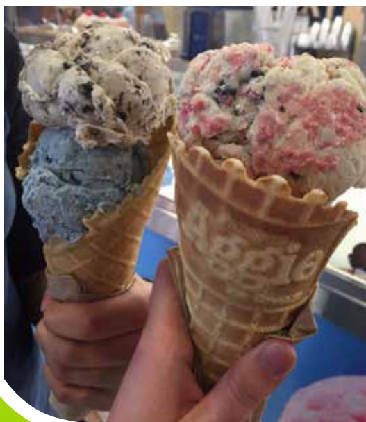
Aggie Ice Cream

Discounted sliced sandwich meats including French dip, prime rib, barbecue beef, pastrami, corned beef, turkey and beef jerky. Their products are sold under different brand names in grocery stores across the country.