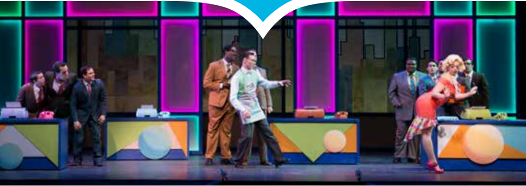
Utah Festival Opera & Musical Theatre

Logan's Freedom Fire Celebration and Fireworks Show , (held July 3rd), (435) 716-9250, loganutah.org . A patriotic celebration with spectacular fireworks and live performances.