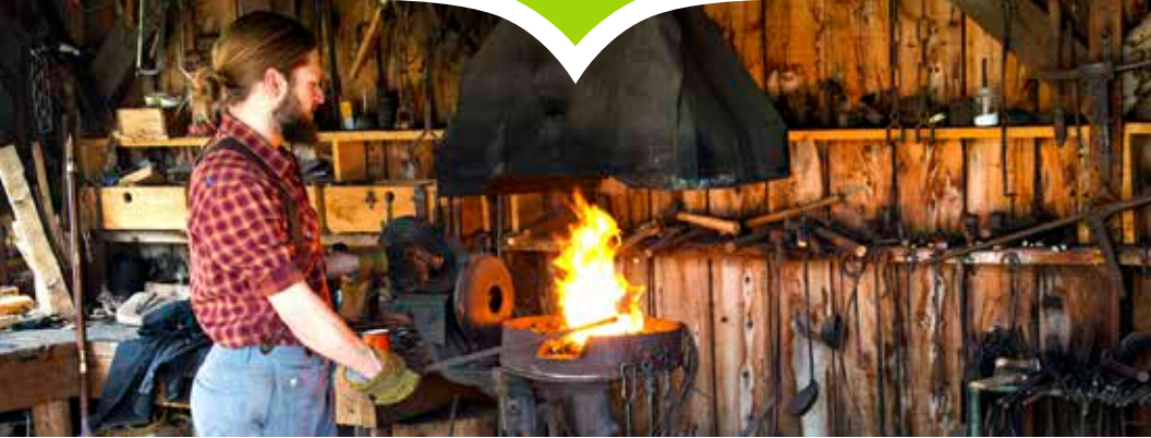
American West Heritage Center