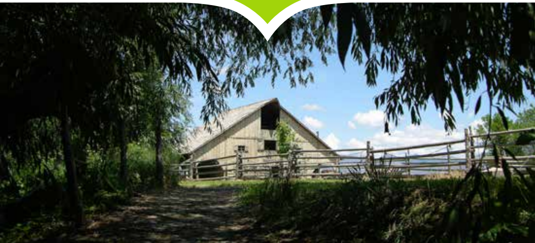
American West Heritage Center