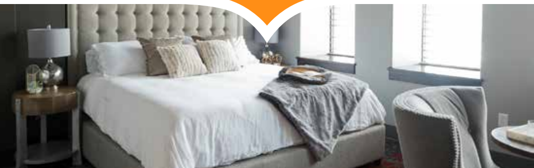
The Flats Luxury Suites