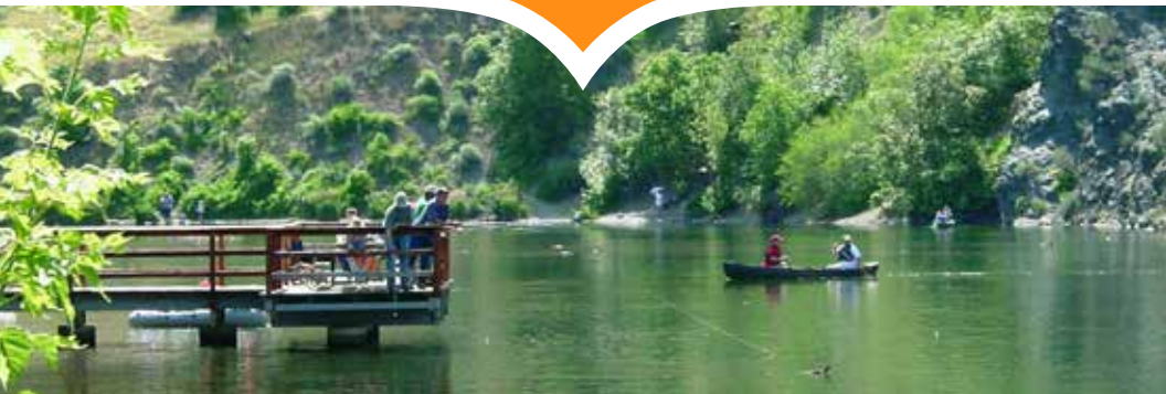
First Dam in Logan Canyon