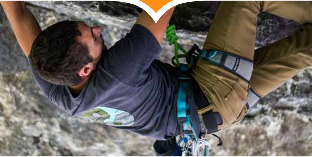
Rock Climbing in Logan Canyon