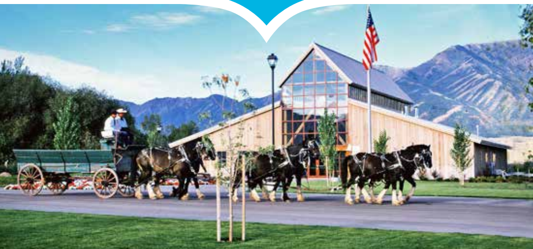
American West Heritage Center