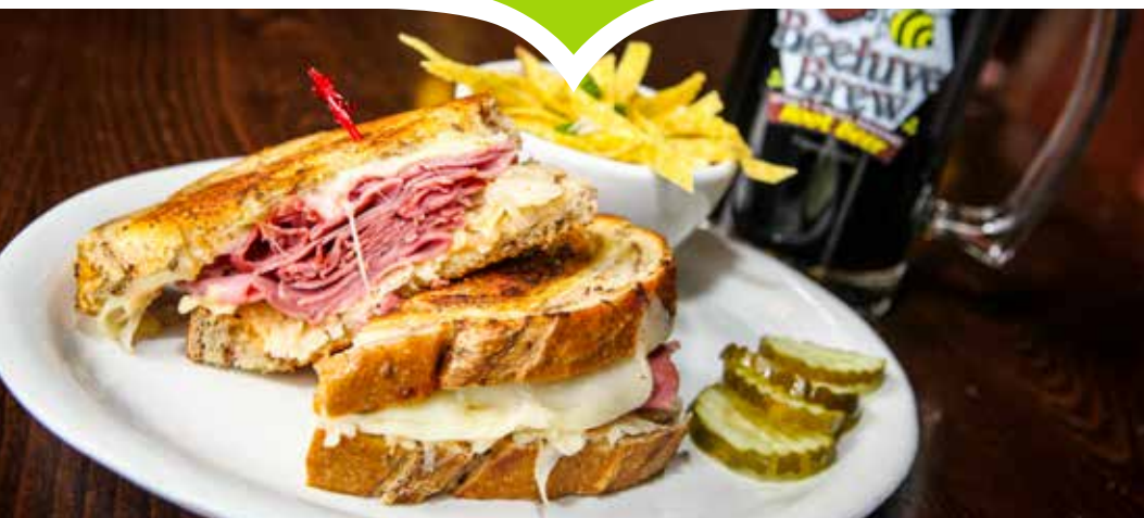
The Beehive Grill