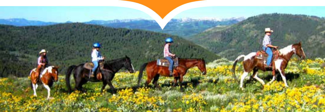
Horseback riding with the team from Beaver Creek Lodge