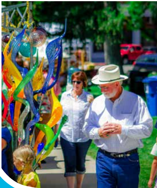
Summerfest Arts Faire

18 holes of miniature golf (April-October).